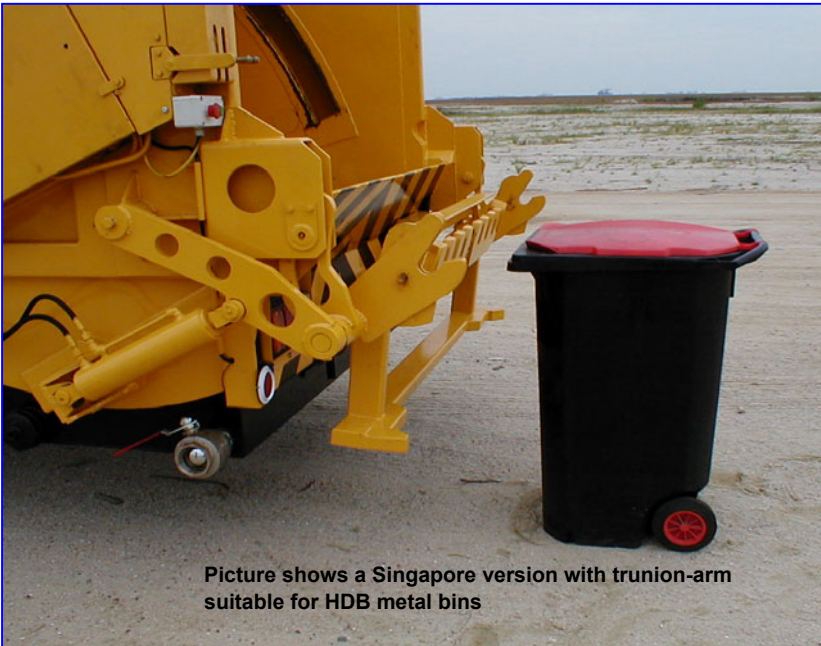
Picture shows a Singapore version with trunion-arm suitable for HDB metal bins

Trunion Lifting is available upon request .