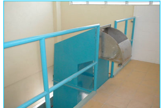
Binlifter designed to lift 2 X 240 ltr OR 1 X 660 ltr DIN bins.