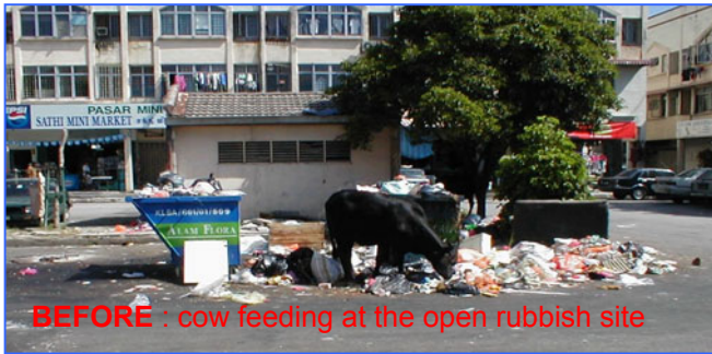
BEFORE : cow feeding at the open rubbish site